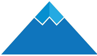
LILY SETO COACHING & CONSULTING