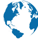
GOLDVARG Consulting Group